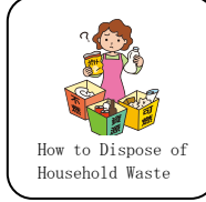
How to Dispose of Household Waste