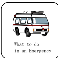
What to do in an Emergency