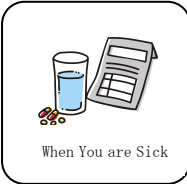
When You are Sick